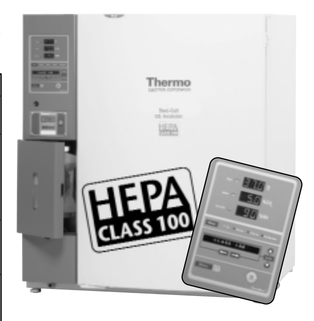
figure 1-Steri-Cult CO<sub>2</sub> Incubator with Class 100 Air

Class 100 air is achieved and maintained within the Series II Water Jacketed, Steri-Cycle, Steri-Cult, and Steri-Cult R CO<sub>2</sub> Incubators by way of our advanced incubator design and HEPA Filter Airflow System.*